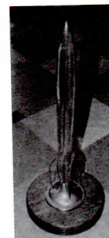
Chicon IV (1982)