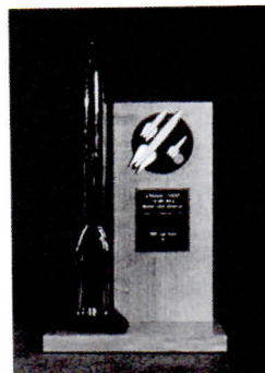
Chicon 2000 (2000)