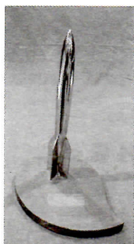
Chicon III (1962)